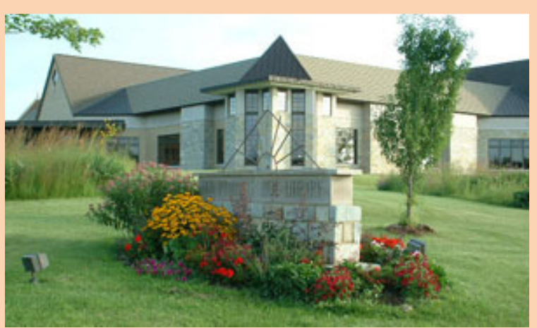
Sun Prairie Public Library as it stands now (2011).