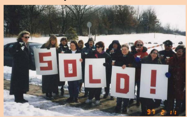
Sun Prairie residents and committee members gather outside the purchased library plot.

The city came up with a $5.6 million dollar, 36,000 square foot building plan with $2 million of that expected to be gained via fund-raising. If the $2 million could not be raised it was a distinct possibility that the building plan could be changed to account for the loss funds. Budget planning for 1998, when the new library was anticipated to open, was tight with the city council debating over streets funding or library funding. Luckily, the fund-raising effort met with huge success. The committee organized raffles, drives, shirt sales, dinners and numerous other events. The committee also created an opportunity for donors to give to specific