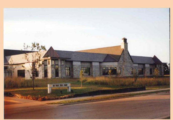
Sun Prairie Public Library after construction is completed.