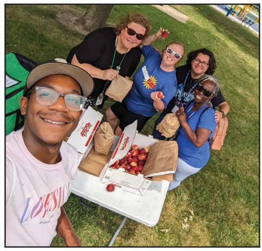
Summer Lunch Program partners